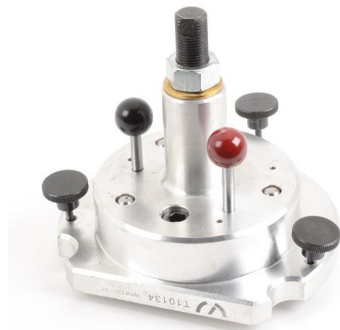
Special Service Tool

When deciding to replace the rear main seal it is worth considering these units are typically fitted with Teflon seals. These seals do not wear a groove in the crank like traditional rubber-spring oil seals and in general have a much longer service life. This needs to be weighed against the difficulty and investment in tools required to complete the job as well as the age and intended use of the vehicle.